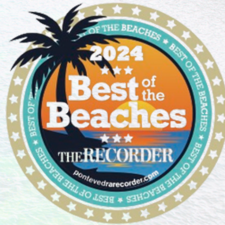
BEST OF THE BEACHES NONPROFIT 2024