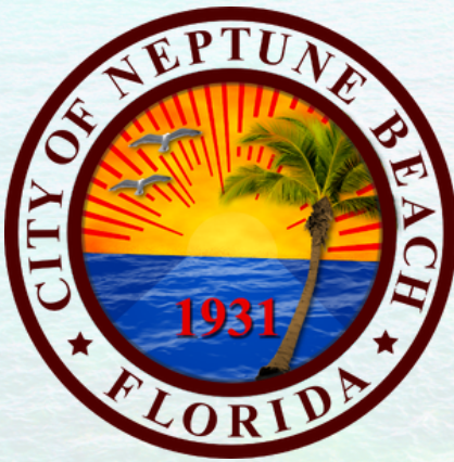
CITY OF NEPTUNE BEACH TRIDENT AWARD 2024

BEACHES GO GREEN, A 501(C)(3) NONPROFIT, AIMS TO CREATE AWARENESS AND EDUCATION AROUND THE WASTE THAT WE PRODUCE AND HOW IT IMPACTS OUR HEALTH AND THE HEALTH OF OUR PLANET. WITH A FOCUS ON PLASTIC POLLUTION, WE ARE ENCOURAGING PEOPLE TO TAKE SMALL STEPS TO DECREASE THEIR PLASTIC CONSUMPTION AND OVERALL WASTE. WE BELIEVE THAT THROUGH AWARENESS AND EDUCATION, PEOPLE WILL MAKE SMALL CHANGES IN THEIR LIVES THAT WILL ADD UP TO BIG CHANGES FOR OUR HEALTH AND THE HEALTH OF THE PLANET.